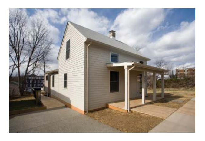
Figure 3. plan diagram of modular accessory unit (left), modular bedroom addition (center) and historic house (right)

Over the next year, PHA officials considered a variety of solutions to the problem of being stuck with a historic property without the budget to restore it. One option was simply to put the house and cottage back on the market. In the summer of '06, as ecoMOD was about to start the design process for the third iteration of the project, PHA approached me about taking on the historic house. PHA had already worked with ecoMOD for ecoMOD1. PHA and I decided to make the home the focus of an extensive effort to research its history, carefully restore and improve it, and place a prefab bedroom addition behind it, as well as a new detached, prefab accessory unit – replacing the original cottage that had by then been torn down.