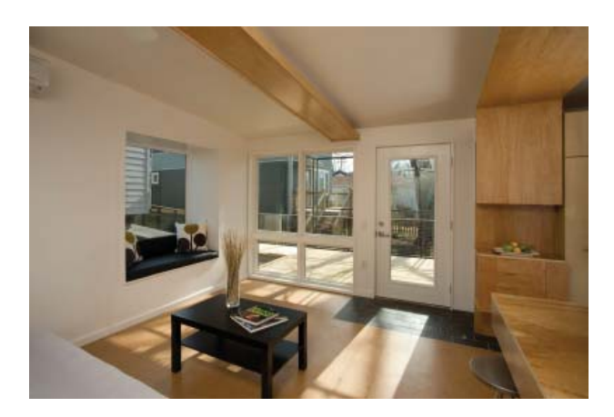
Figure 5. interior of ecoMOD3 historic house

Another challenge the team faced was with the reinstalling the flooring. Much of it appeared to be in good condition, and some of it was not. The builder was concerned about the difficulty of reinstalling the flooring, but the HP team was committed to saving as much of it as possible, and reusing it in the home. The students took the flooring to the ecoMOD fabrication facility and sorted it by size, vintage and condition. They trimmed the good pieces, and sent all the truly 'bad' pieces to a wood recycler, but were able to clean up the vast majority of the material. They didn't have quite enough of the newer (perhaps mid-20th century) oak flooring that was going into the bathroom, so the builder purchased some inexpensive new oak that matched it perfectly. When the floor was sanded and finished, the students felt vindicated because the floor looked terrific - almost too good because it was difficult to tell it was old wood.