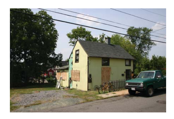
Figure 1. ecoMOD3 historic house before

perwork for a demolition permit for the house and the accessory cottage in February '05. To everyone's surprise, the city issued the permit for the cottage, but not the house. Apparently it had been individually designated as an important historic property, and while the neighborhood was not an historic district, the designation had the effect of putting the demolition and any potential new construction on the site under the purview of the local Board of Architectural Review (BAR). PHA was in a state of disbelief since the house was in such bad shape. It was difficult to imagine that it had any historic value. It appeared to have been occupied by squatters and used as a crack den. It would undoubtedly cost a lot more to renovate than to build a new affordable house, especially since it needed to meet the guidelines of the BAR for historic properties. They soon learned the historic designation was due to evidence that the house dated from the mid 19th century, not the mid-20th century as had been assumed, and there was reason to believe the original core of the house had been built as a slave quarters.