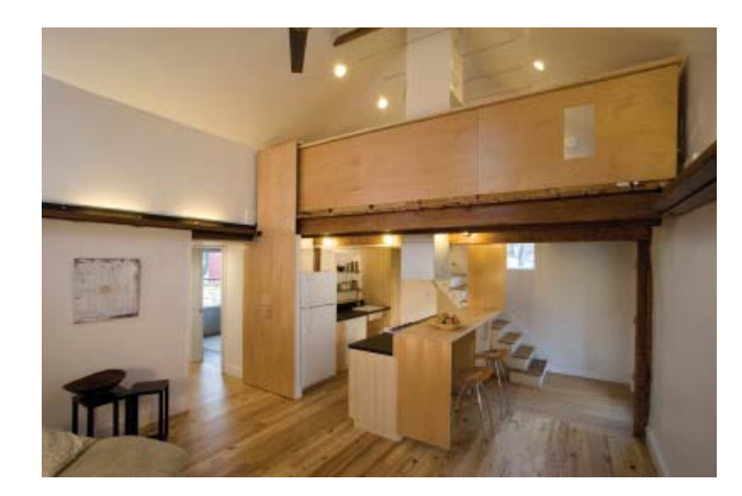
Figure 4. interior of ecoMOD3 accessory unit, showing `SEAM' at right

Despite the emphasis on the very specific history of the house, the design team's goal with the bedroom addition and detached accessory unit was to create a modular system that was flexible enough to attach to any home. The team was constantly aware of the immediate context, but simultaneously strived to imagine the adaptations that would be required to create a variety of permutations. The team avoided a 'one-size-fits-all' solution and instead designed a system that included three module types, two roof profiles and a variety of window locations and sizes that could be arranged according to the climate, solar orientation, topography and preferences of the homeowner. A 12' x 16' volume is constant, but the modules can be attached to each other in a variety of ways, and can even be stacked.